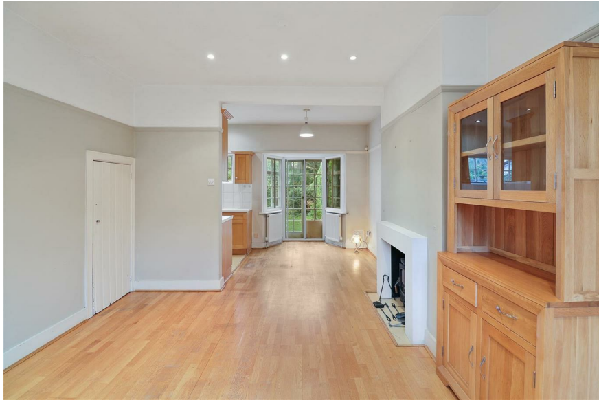
Oakwood Road, NW11 6RJ